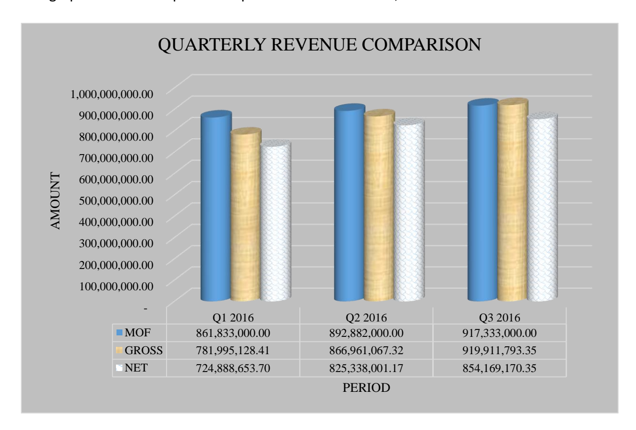
Figure 2: Quarterly Revenue Contributions

The graphs show a comparison of performance for the Q1, Q2 and Q3 of 2016