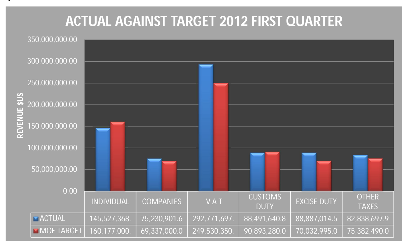
Fig 1: Actual collections versus target

The following bar graph shows the actual collections versus target per revenue head for the first quarter of 2012.