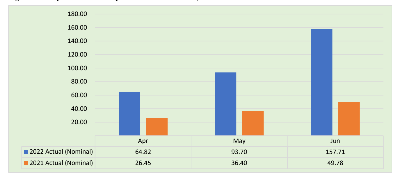
Figure 4: Comparison of monthly net revenue collections, 2022 vs 2021

Despite slow economic recovery, monthly revenue collections maintained a positive trajectory and recorded significant growth compared to what was realized in 2021.